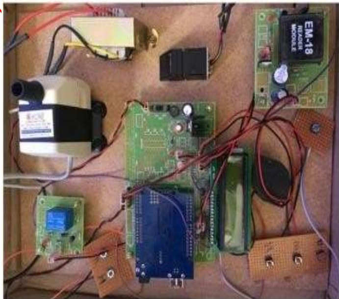
Fig 3: Hardware setup of petrol pump automation system

The arrival of a vehicle at the petrol station area initiates the flowchart for an RFID-based automated petrol pump system. The vehicle's RFID tag is detected by RFID readers placed at the entrance, and this information is forwarded to the central system for processing. The central system then accesses the database to retrieve the vehicle information linked to the RFID tag, such as the fuel type, credit limit, and transaction history. To guarantee that the car is authorised for fueling, the system verifies the vehicle data, such as the credit limit and payment history. The system checks the availability of fuel, the credit limit, and any restrictions or alerts related to the vehicle before moving onto authorise filling if the vehicle passes the verification check.