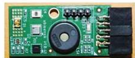
Fig 2. Ubi-sense mote

Proposed framework has three modules – Homestead side, Worker side and Customer side. Homestead side arrangement is as displayed in figure 1. It comprises of six techniques as follows. The sun situated board supplies power for the sensors charging and laborer structure presented outside, so the system is fitting in an agricultural environment whether or not no external power is given. IOT serves the property field through distinguishing close by country limits, reliable trade of data and watchful decision help and early advice", which analyzes to the three layers of IOT, to be explicit, insight layer, network layer and application layer.