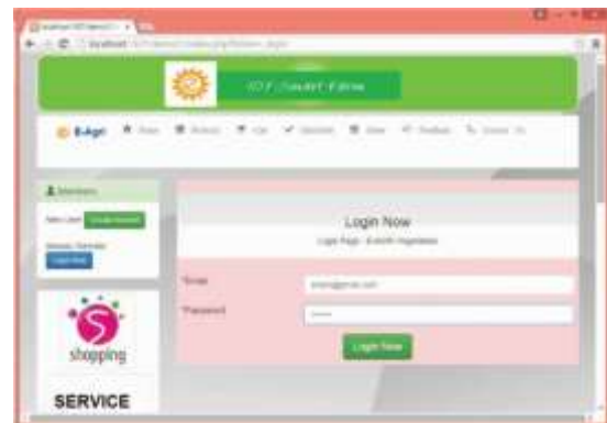
Fig. 5. Web Application

Farm field may have assorted yield districts. In these gather districts Ubi-Sense pieces are presented. Data from Ubi-Sense spot will be moved to Ubi-bit Worker side module. Decision sincerely strong organization will be done for alerts, crop noticing. Client side module contains web application similarly as compact application on android working framework as shown in figure 5 and figure 6.