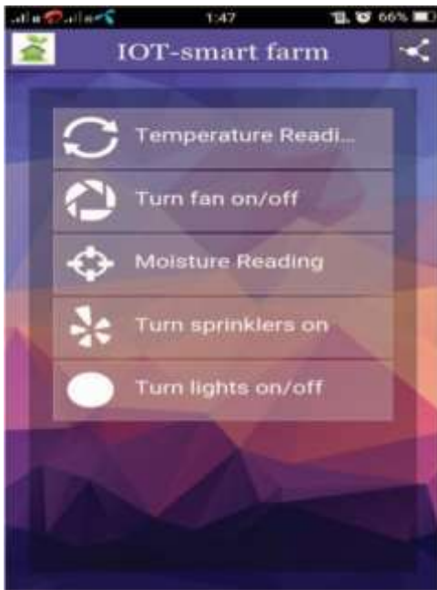
Fig. 6. Android Application