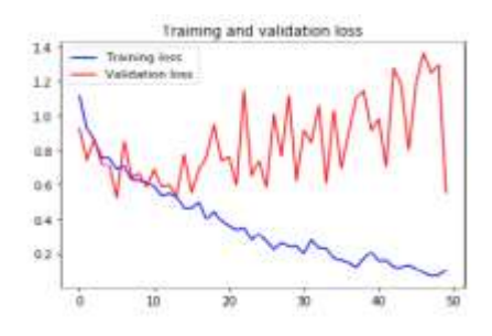
Fig. 5 Training and validation loss