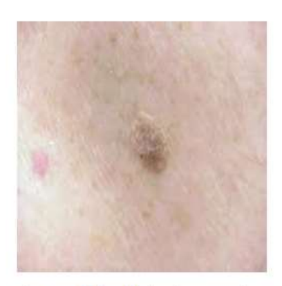
Fig.3 Sebborheic keratosis